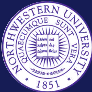
Danny Yu Engineering