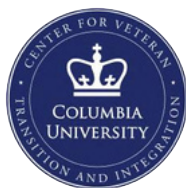
Charlotte Quek Natural Sciences